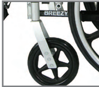
Angle-Adjustable Front Casters Accommodate angled seating surfaces without moving the caster housings out of square.