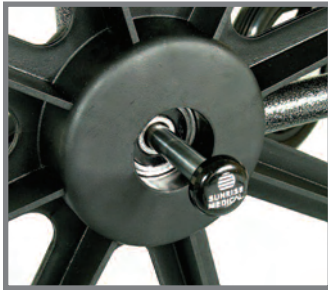
Quick-Release Wheels Make loading in/out of vehicles easy.