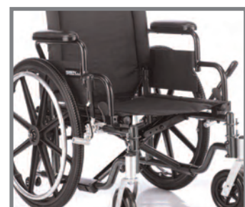
Hemi Frame Allows for a seat height as low as 13.5".