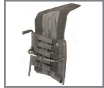
Tension Adjustable Back Highly adjustable velcro strap system provides customized postural support.