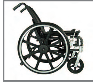
Angle-Adjustable Back Back adjusts from 6° anterior to 24° posterior in 6° increments for better positioning. Height adjusts to 17", 18" or 19".