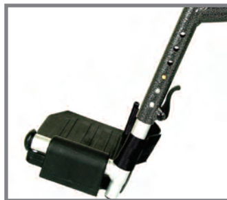
Quick-Adjust Footrests Adjust height without tools using spring-loaded detent buttons. Heel loops adjust with Velcro ® .