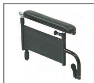
Height-Adjustable Arms 4" vertical adjustment allows for use of cushions.