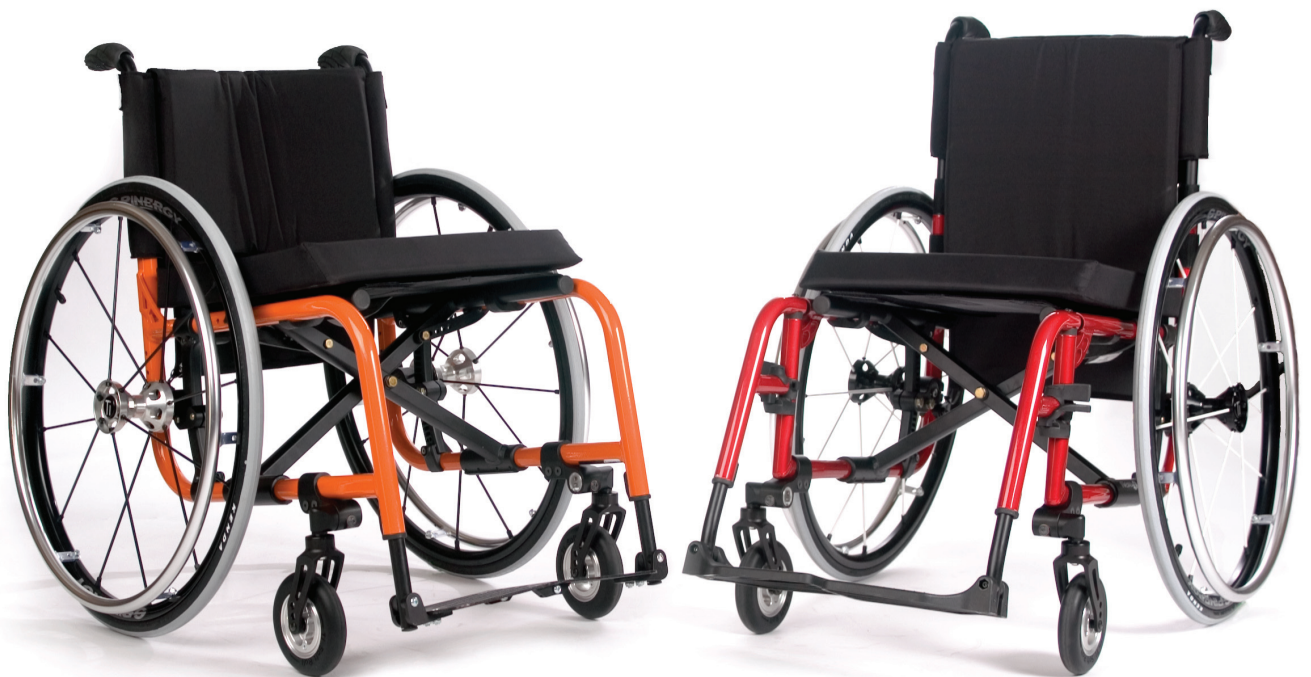
Aero X Shown with Available Options