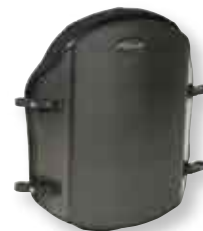
JETSTREAM PRO™ BACK SYSTEM