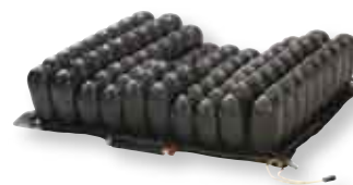
CONTOUR SELECT™ CUSHION