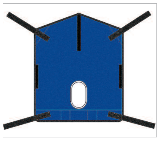
Model no. R141 Mesh sling with commode opening