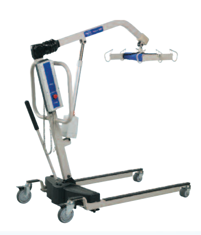
Model no. RPL600-1 Power lift with low base.

Designed to meet the special needs of your patients weighing up to 600 pounds, the Invacare® Reliant™ 600 heavy-duty lift is secure and sturdy, providing a safe alternative to manual lifting. Both durable and functional, the Reliant 600 is also a reassuring and comfortable patient lift. When answering the needs of every patient is your priority, this is your wisest choice.