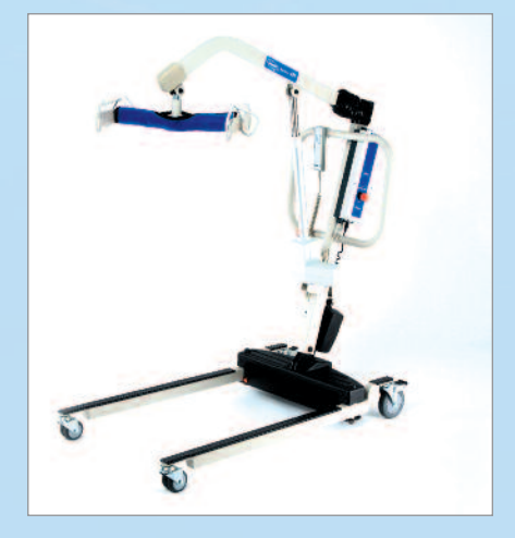
Power lift with power opening low base. Model no. RPL600-2