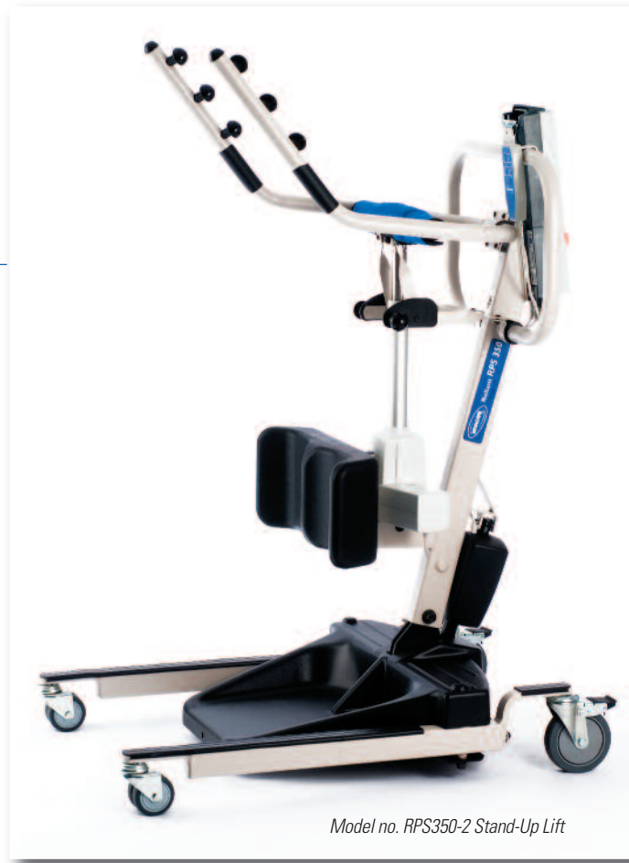
Model no. RPS350-2 Stand-Up Lift