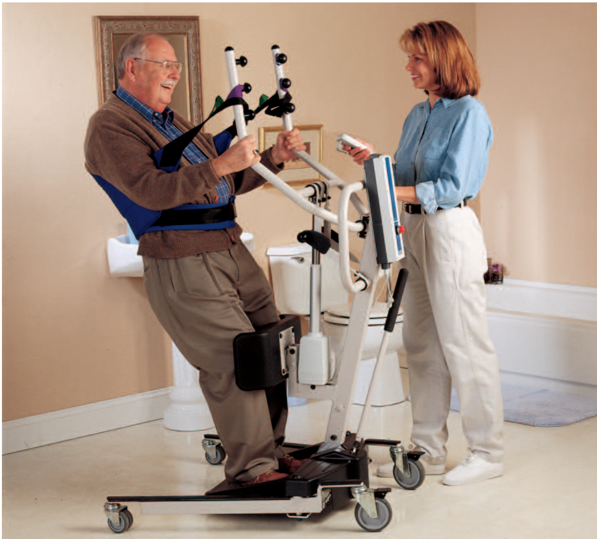
Shown with R130 Standing sling