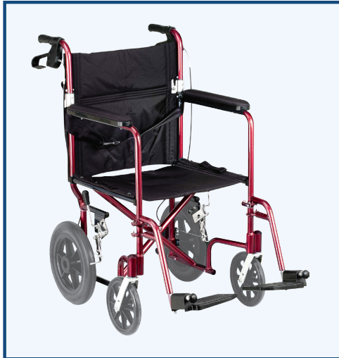
Item # EXP19RD Shown

It is important for the attendant to be familiar with proper assisting procedures in any situation that requires the use of the Transport Chair. Safety is the Key consideration. Consult your physician, nurse or physical therapist to determine methods most suitable for your individual needs and abilities.