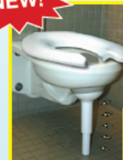
Top of Short Support Swivels