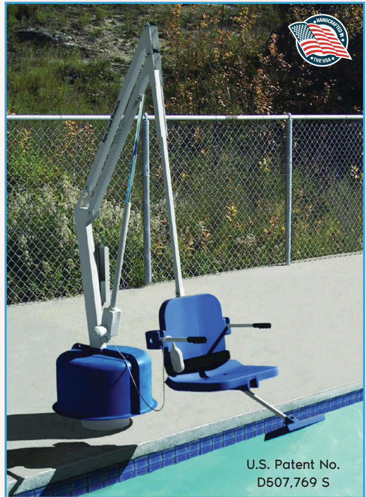
U.S. Patent No. D507,769 S