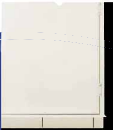
▲ Top landing gate with mechanical interlock that releases only when platform reaches the top of landing