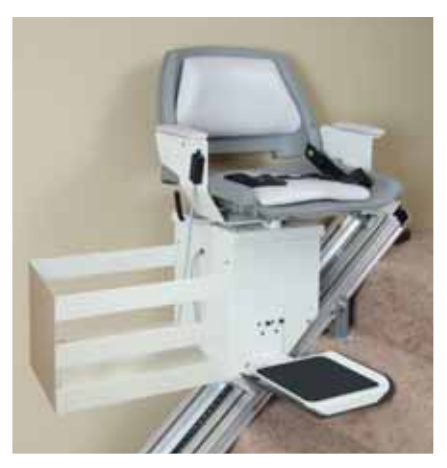
Use the optional side-car basket to carry groceries, laundry and other items up and down stairs.