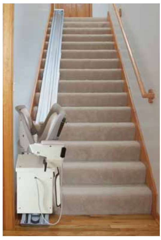
Our lift folds to within 15^{1}/_{2} " of the wall when not in use, and the track is only 11^{1}/_{2} " wide, leaving plenty of room for foot traffic.

Unlike other manufacturers, we provide you with the choice of two convenient power options. Choose between safe, AC electrical operation (low voltage, 24V controls), or add protection against power outages by using our DC battery operated system. Unlike other units, our DC battery operated unit continually recharges regardless of its position on the track. This eliminates the need for you to remember to park the lift on charging pins or to make sure it is in a charging zone.