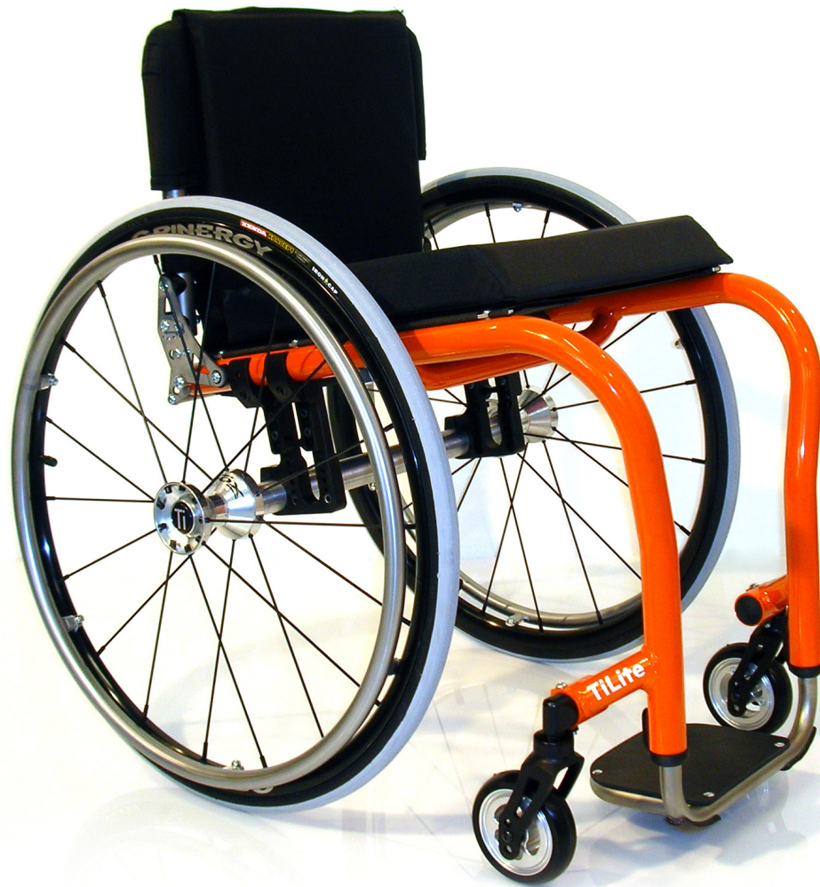
Aero Z Shown with Available Options