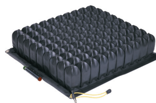
HIGH PROFILE® QUADRO SELECT®