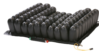
CONTOUR SELECT® CUSHION