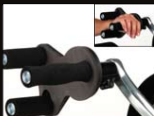
Tri-pin quad handpedal.