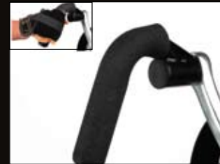
Foam covered ergonomic handpedal/quad glove.

The Invacare® Top End® Excelerator™ XLT Jr. handcycle is designed for kids and small adults with 20" cruiser wheels. Shown with foam covered vertical handpedals