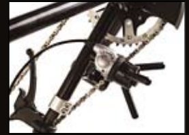
Quad Twist Shifter.