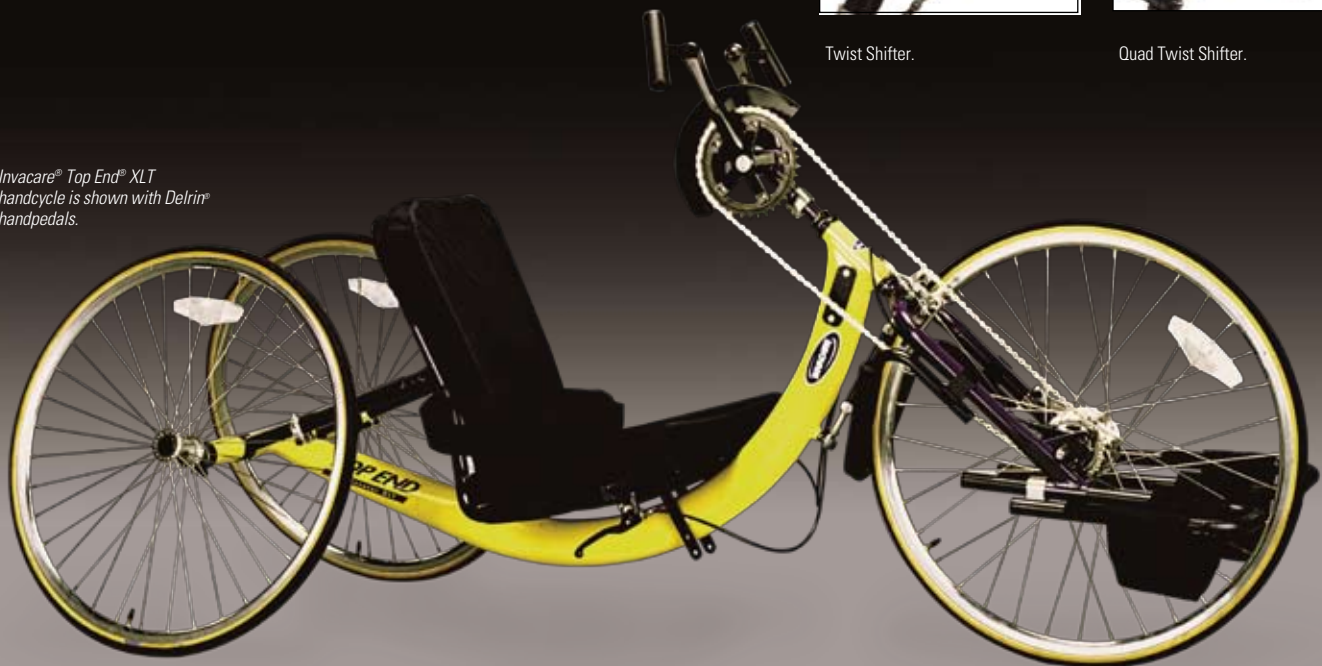
Invacare® Top End® XLT handcycle is shown with Delrin® handpedals.