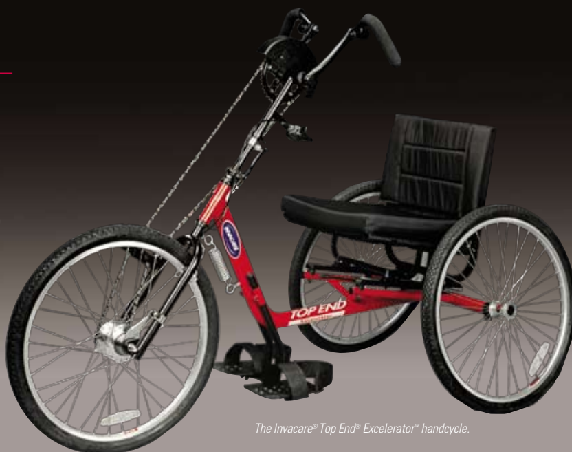
The Invacare® Top End® Excelerator™ handcycle.