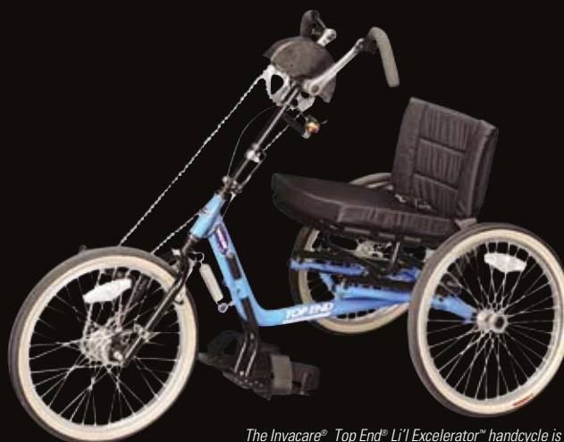
The Invacare® Top End® Li1 Excelerator™ handcycle is designed for children and has 20" cruiser wheels and tires.