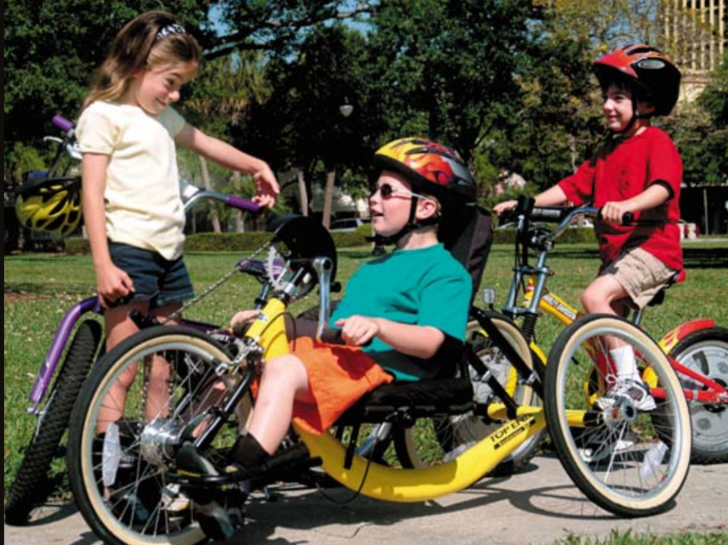
Horizontal pedals are best for younger kids.