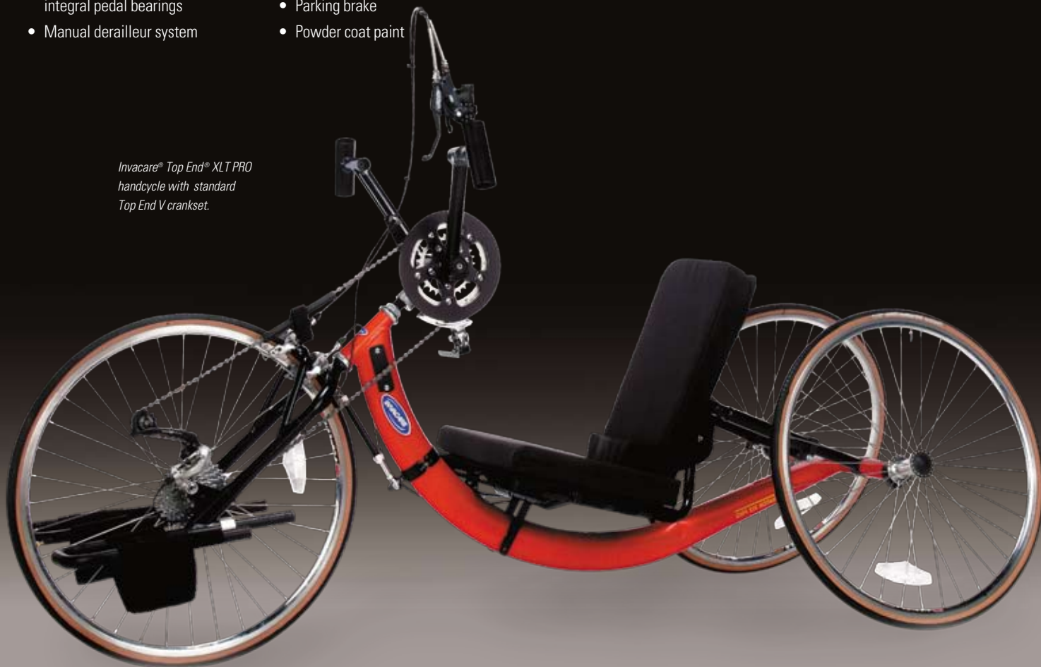
Invacare® Top End® XLT PRO handcycle with standard Top End V crankset.