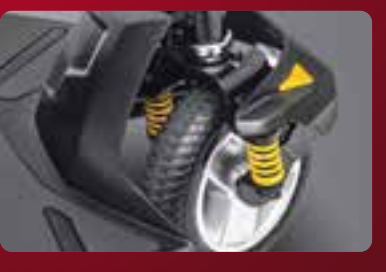
Comfort-Trac front and rear suspension for added comfort.

The Go-Go<sup>®</sup> LX with Comfort-Trac Suspension (CTS) offers a whole new level of comfort and performance. This industry-first CTS technology incorporates advanced suspension for improved absorption over various terrains. The Go-Go LX with CTS offers a 300 lb. weight capacity, a per charge range up to 8.6 miles and a maximum speed of 4.4 mph.