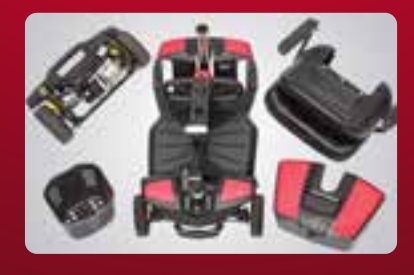
Feather-touch disassembly for quick transport or storage.

Charger port located conveniently in tiller.