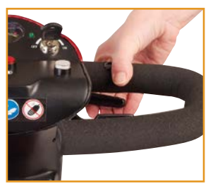
EZ Reach tiller adjustment