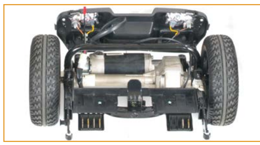
Quiet & maintenance free motor