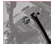
Hold-down foot (Scooters only)