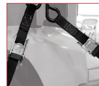
Retractable strap kit