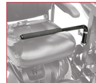
Hold-down arm (Power wheelchairs only)

Consumers have the choice of a hold-down arm (power wheelchairs), hold-down foot (scooters), or retractable strap kit.